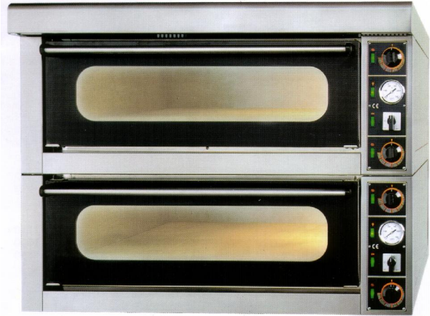
Double module with hood